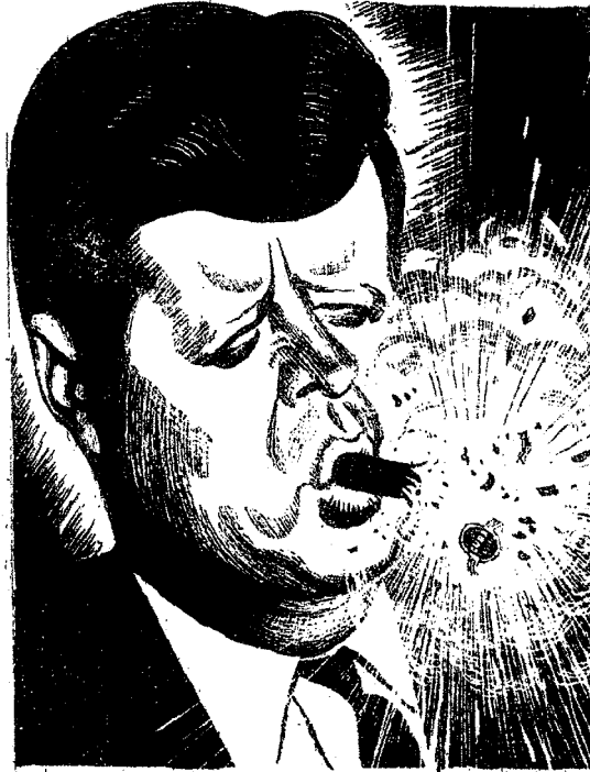
A cartoon published in Britain on 21 April 1961. The cigar represents the Bay of Pigs invasion.

In evaluating the CIA's performance it is essential to avoid grasping at the explanation that the President's order cancelling the air strikes was the chief cause of failure. If the project had been better conceived, better organised, better staffed and better managed, would that issue ever have had to be presented for Presidential decision at all?